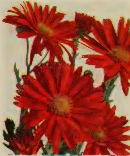
RED TORCH. 50c each; 3 for $1.25